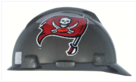
818412NFL Tampa Bay Buccaneers